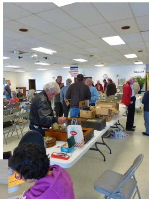
Auction items up for inspection

As usual, there was a wide range of items offered for auction. There were a number of very nice watches, including a couple nice Accutrons in original boxes, a variety of clocks, tools, and printed material. A total of 45 lots were offered for sale, and 33 members purchased bidding paddles.