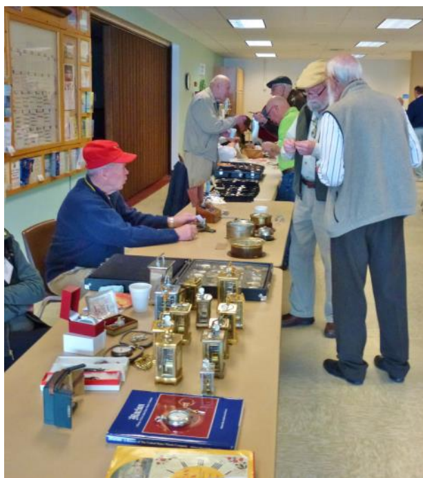
Wheeling / Dealing at the Mart

Our meeting started with the Mart and Hospitality hour beginning at 12:30PM. We had an active Mart,