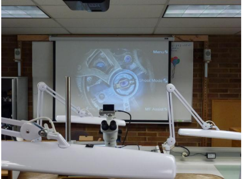
Example of microscope view of a movement projected through the High Definition projector.

The past year has also seen an “explosion” of instructional technology. The classroom now has the ability to project Hi Definition views of close desktop, or wider view desktop as well as variable focus microscope views. There is also new computer and network equipment, and a great Library is in development, as well as the full range of watch & clock repair tools & equipment.