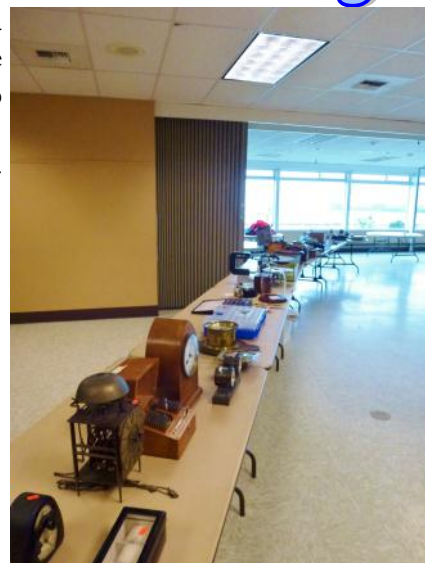
Items on display for inspection

Thanks to those who brought items to sell and those who bid!