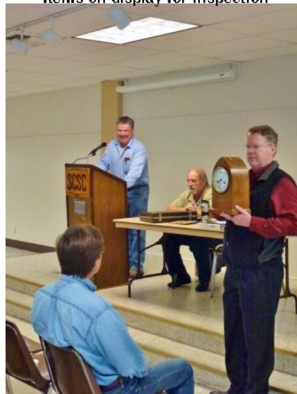
Junhans Beehive bidding