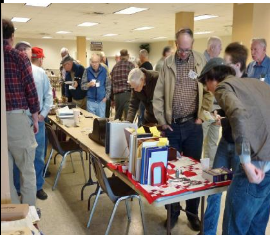
Active Mart at November Meeting.