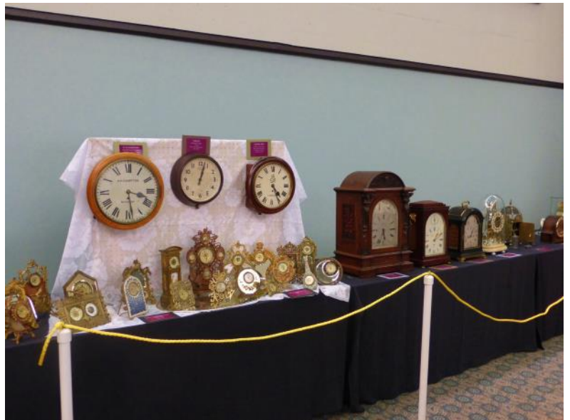
More of the clocks in the English Horology display