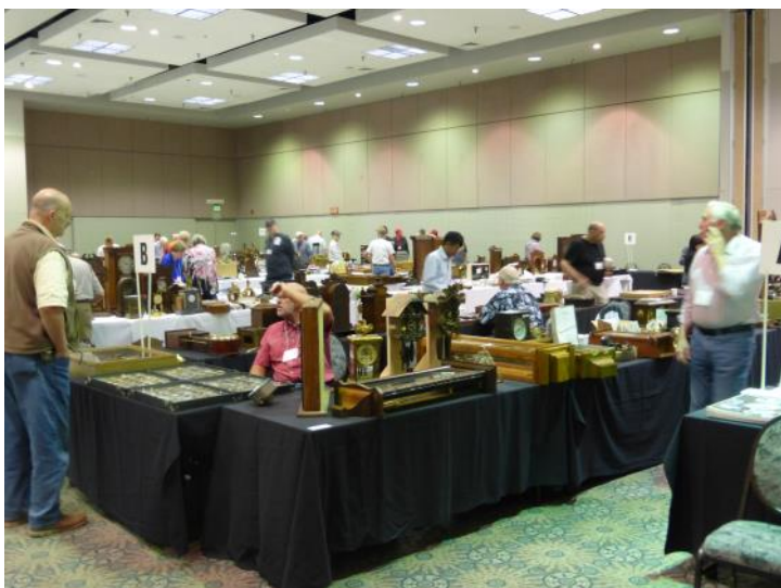
More of the Mart.