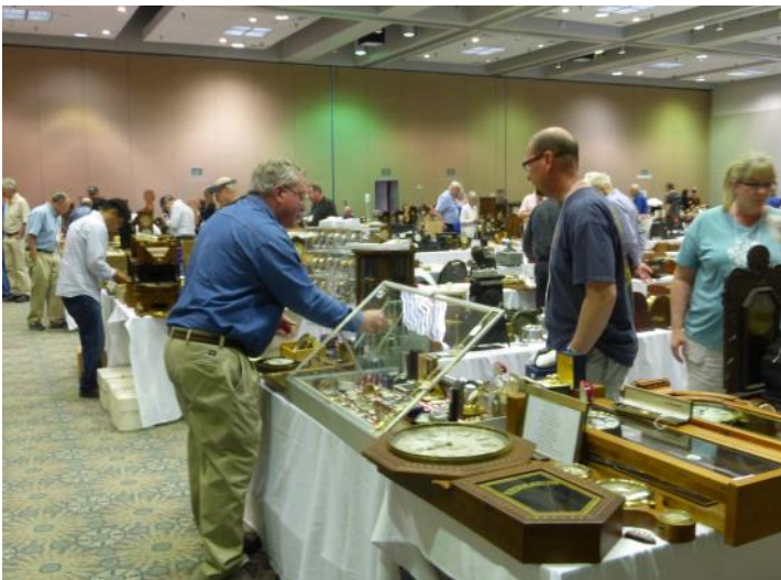
The Mart in action