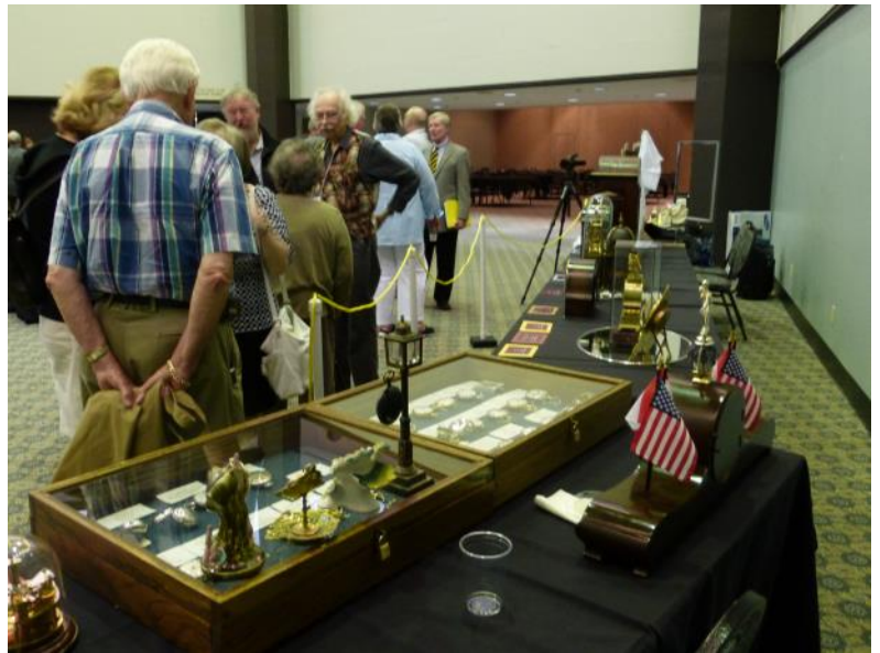
Part of the English Horology display