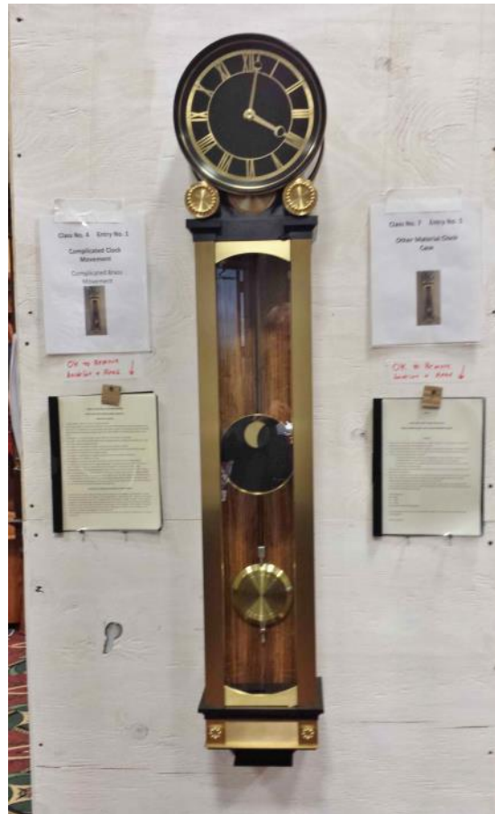
Phil's beautiful long duration clock on display

Phil entered his beautiful long duration clock in two categories of the competition. These were: Class 4 — "Complicated Clock Movement, and Class 7 — Clock Case — .