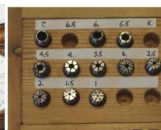
Norm and a selection of ER collets