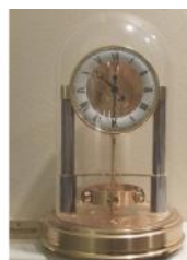
Tom and his Atmos clock

Tom will provide an overview of the theory and operation of an Atmos Clock. Following a discussion of the normal precautions associated with the repair of an Atmos, Tom will demonstrate the removal and reassembly of the bellows from the clock. Several different configurations of Atmos clocks will be available for observation and discussion.